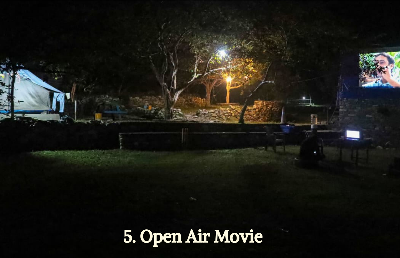
5. Open Air Movie

Select from a range of hand curated packages.