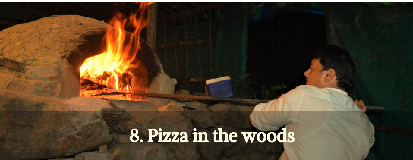
8. Pizza in the woods