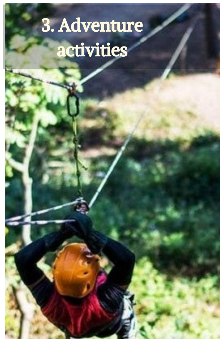
3. Adventure activities