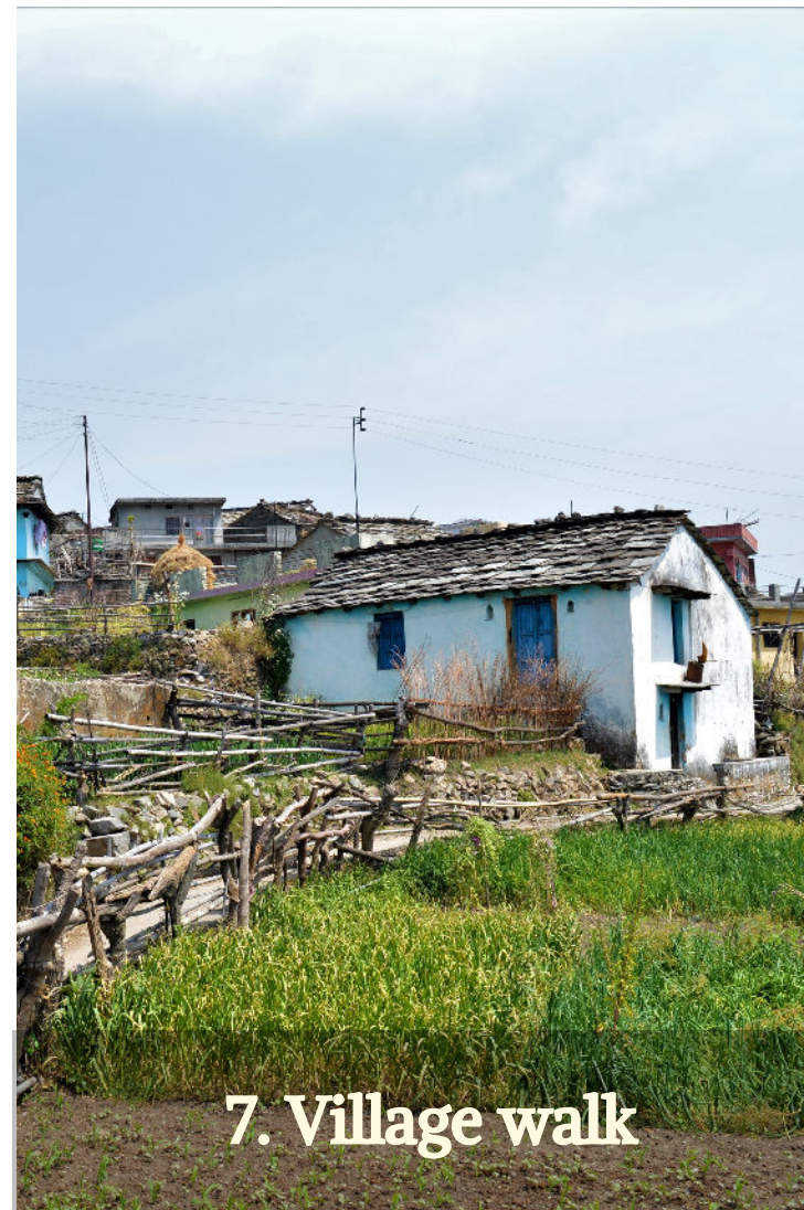
7. Village walk