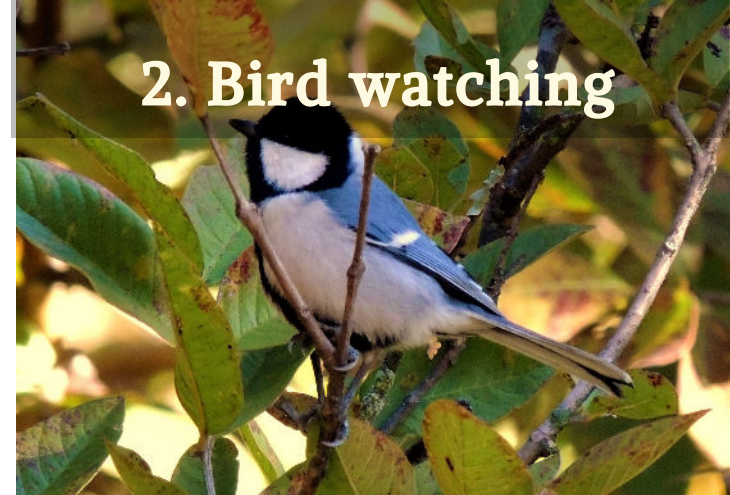
2. Bird watching