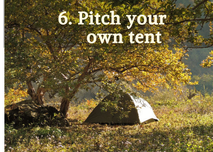
6. Pitch your own tent