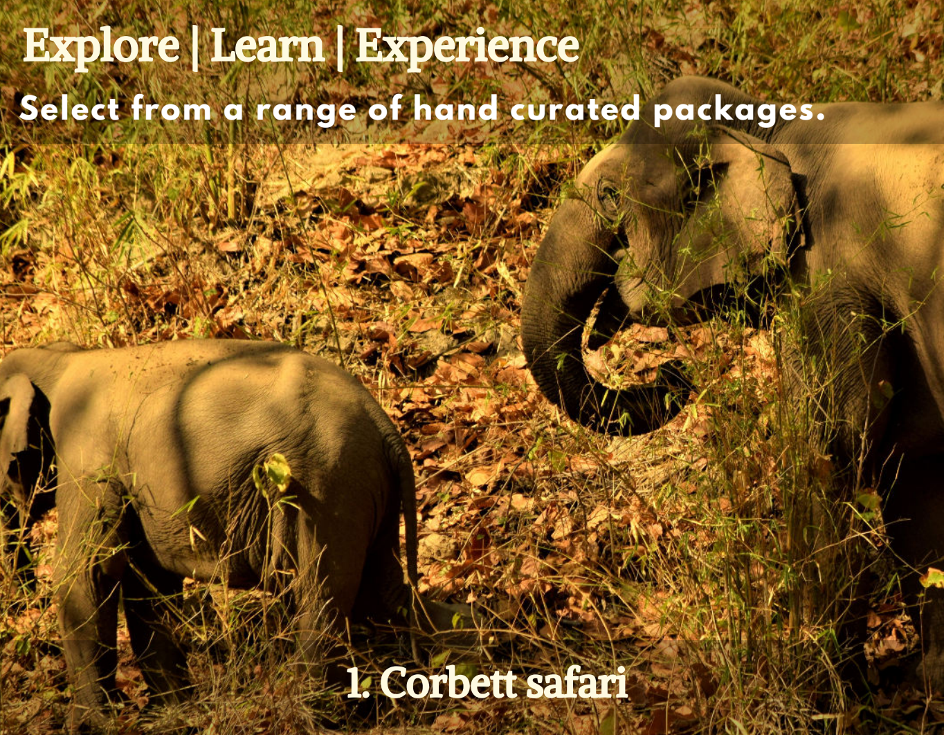
1. Corbett safari

Select from a range of hand curated packages.