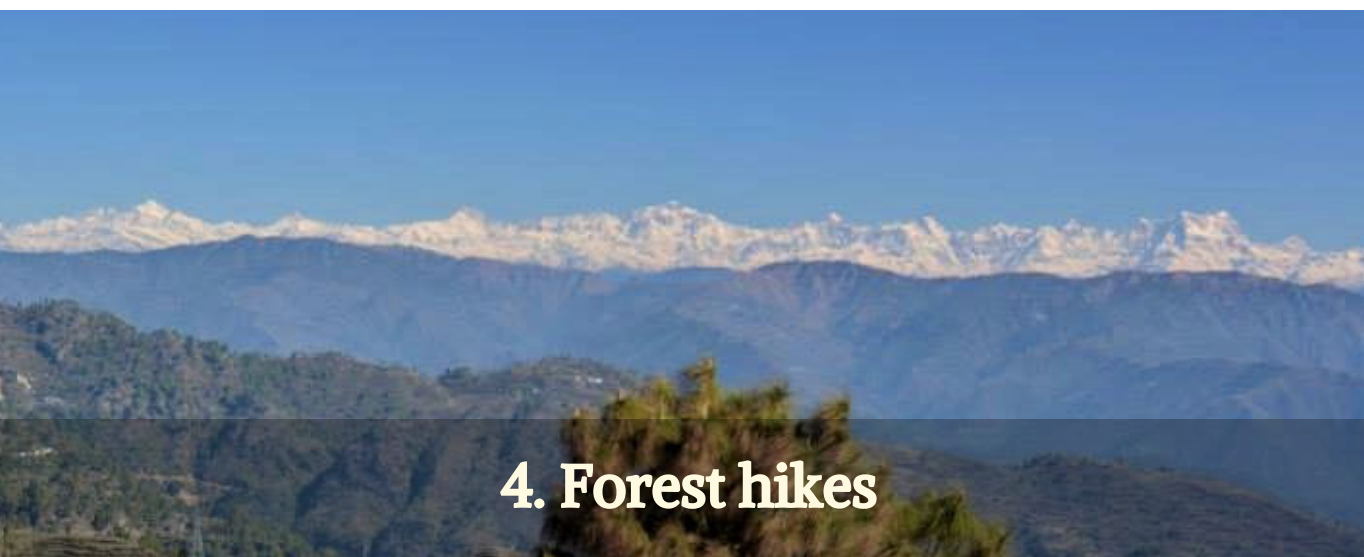
4. Forest hikes